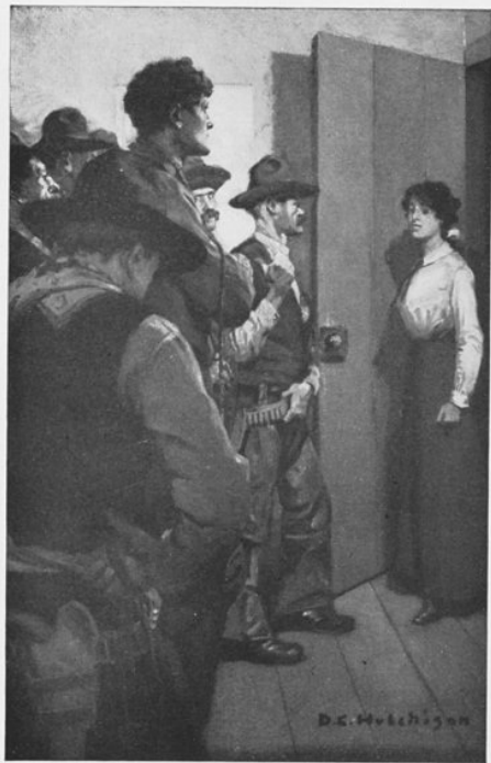
THIS SLENDER GIRL DUMFOUNDED THEM Frontispiece Page 41