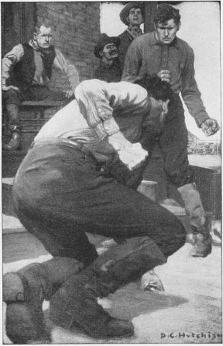
HE WAS THE MADDEST MAN IN ARIZONA.

Curly dropped the matter. To urge him further would only make the boy more set in his decision. But as the days passed he kept one